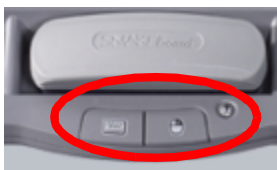
Pen Tray Buttons

The pen tray has at least two pen-tray buttons. One button is used to launch the On-Screen Keyboard. The second button is used to make your next touch on the interactive whiteboard a right-click. Some interactive whiteboards have a third button; this button is used to access the Help Center quickly.