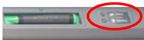
Pen Tray Buttons